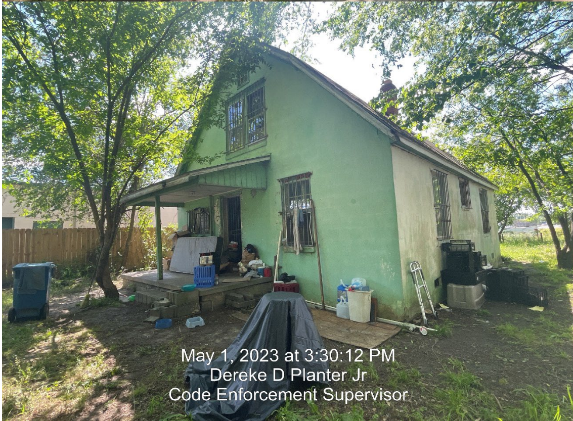
May 1, 2023 at 3:30:12 PM Dereke D Planter Jr Code Enforcement Supervisor

(Adequate posts and railings, All exterior surfaces, including but not limited to, doors, door and window frames, cornices, porches, trim, balconies, decks and fences, shall be maintained in good condition; vacant building secure at all times. Should it become necessary to board the windows and/or doors, it must be done with boards fitted to the openings, screwed in place and painted a color consistent with the surrounding wall area)