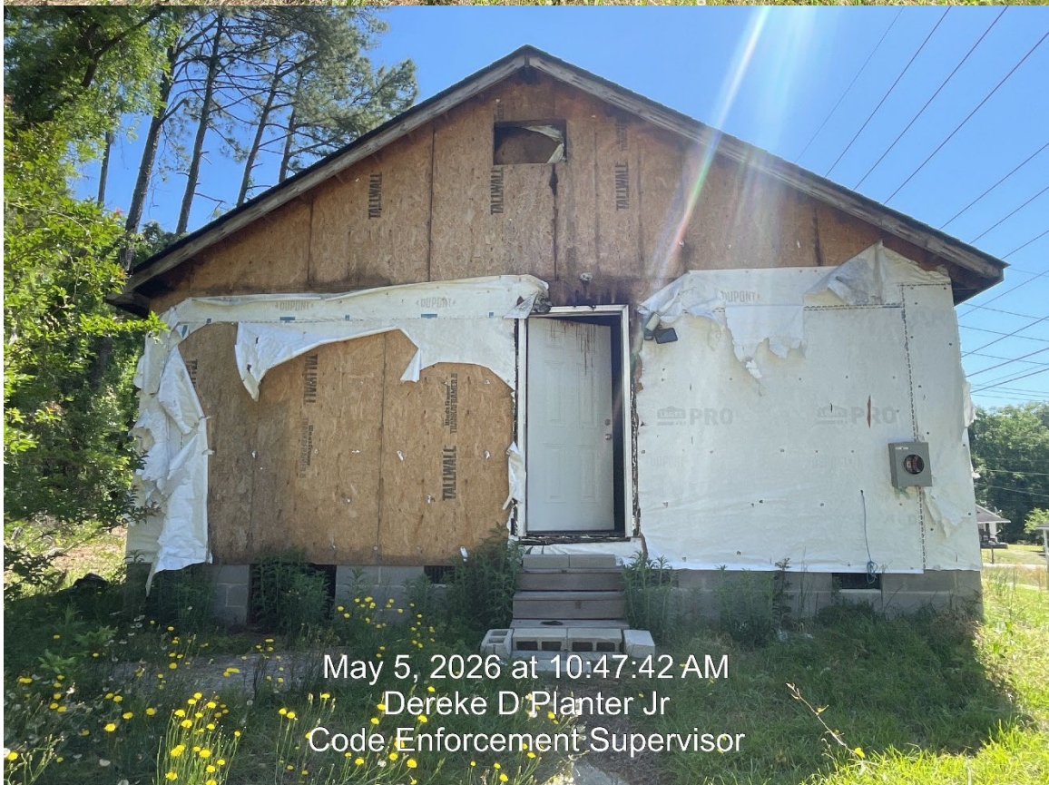
May 5, 2026 at 10:47:42 AM Dereke D Planter Jr Code Enforcement Supervisor

(All exterior finish shall be weathertight without excessive holes, cracks or rotted boards which permit air or water to penetrate rooms; Windows shall be reasonably weathertight)