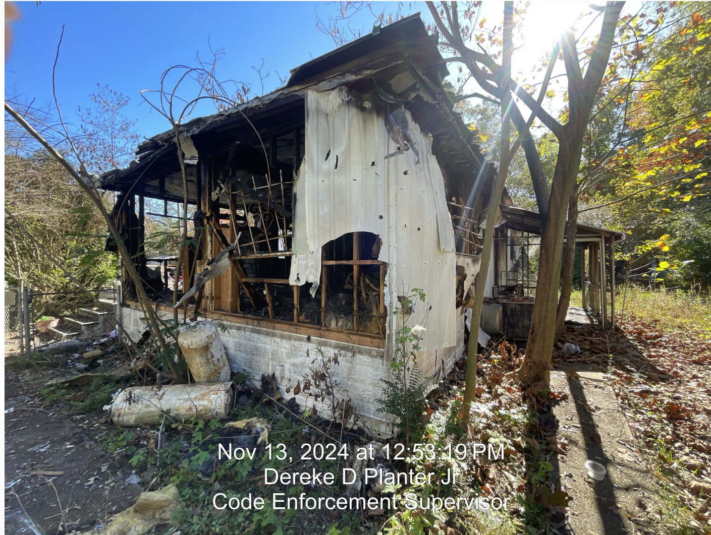
Nov 13, 2024 at 12:53:19 PM Dereke D Planter Jr Code Enforcement Supervisor