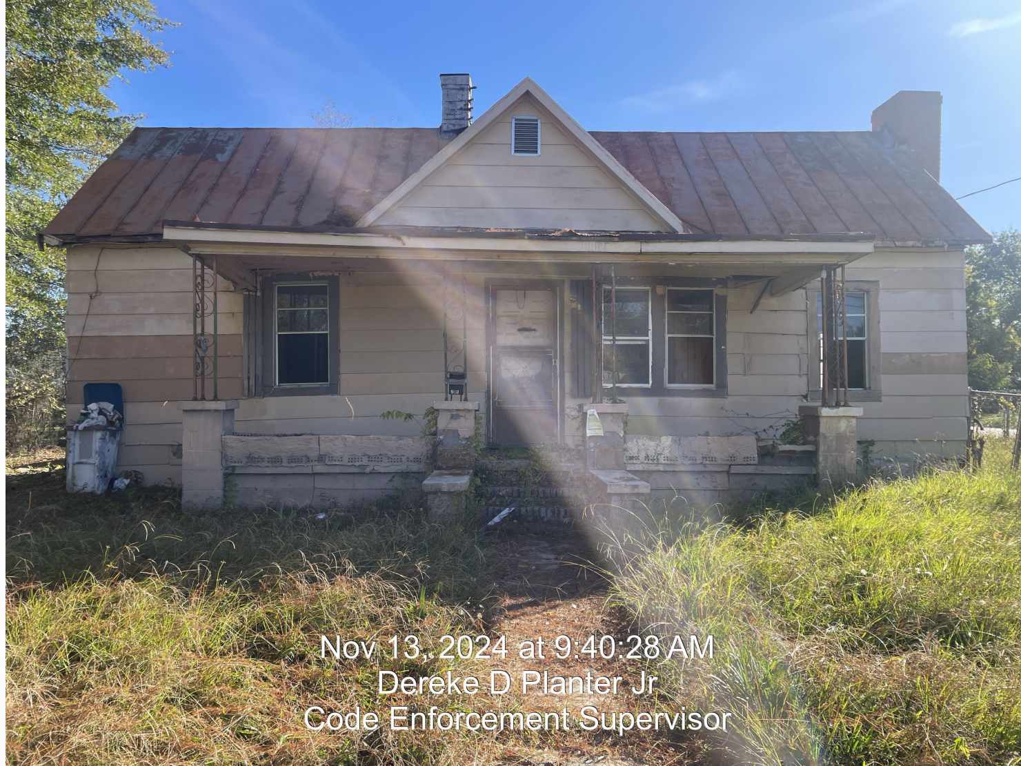
Nov 13, 2024 at 9:40:28 AM Dereke D Planter Jr Code Enforcement Supervisor