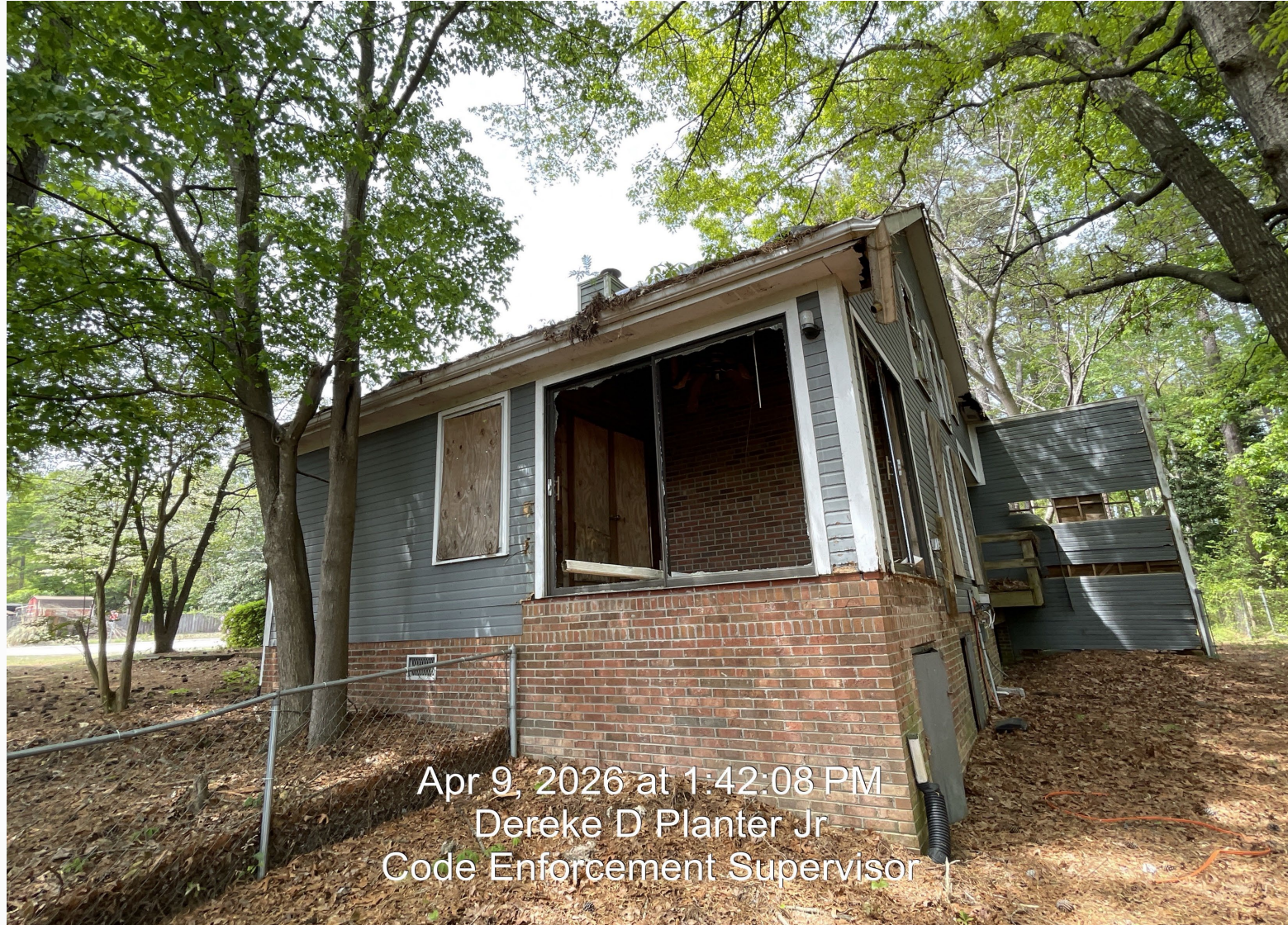
Apr 9, 2026 at 1:42:08 PM Dereke D Planter Jr Code Enforcement Supervisor