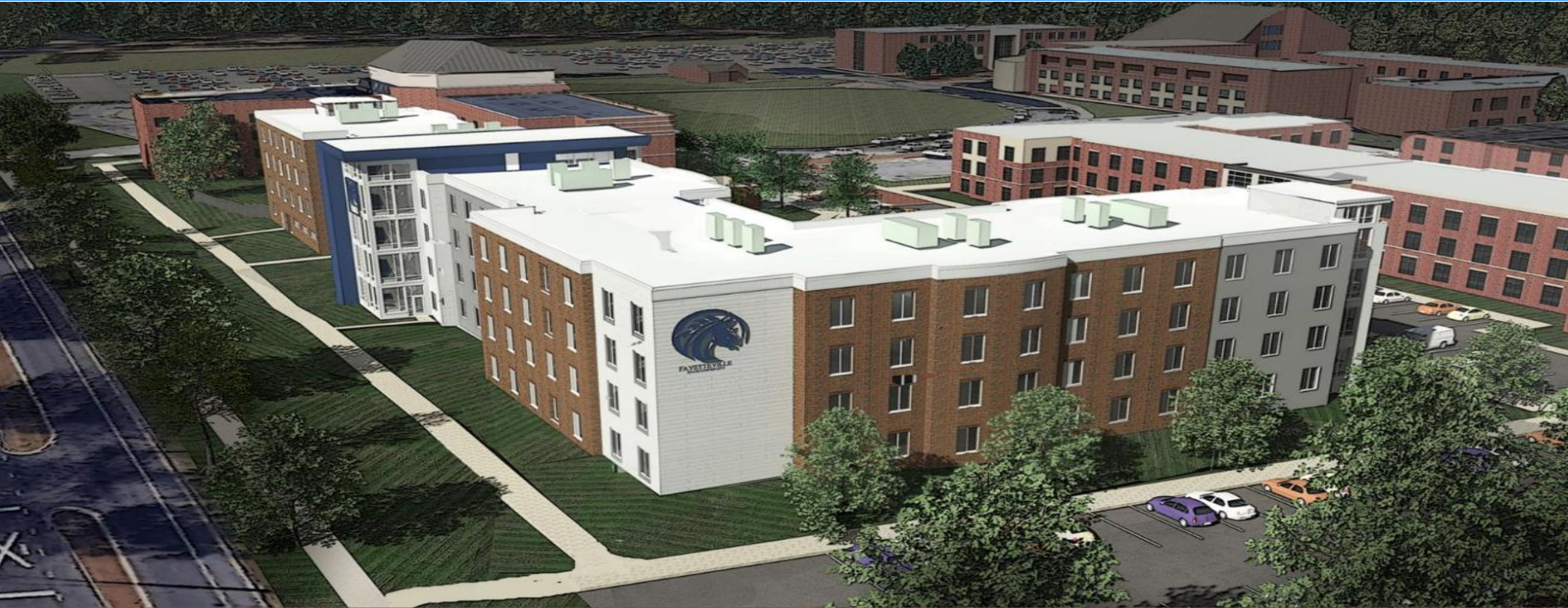
BRONCO PRIDE HALL