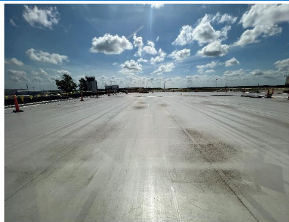
Baggage Claim roofing installation