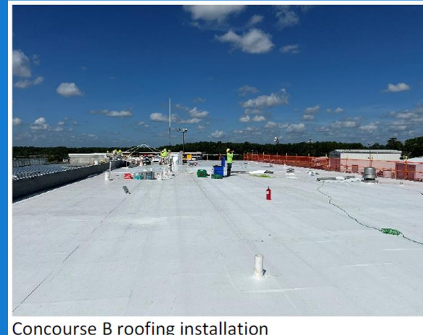
Concourse B roofing installation