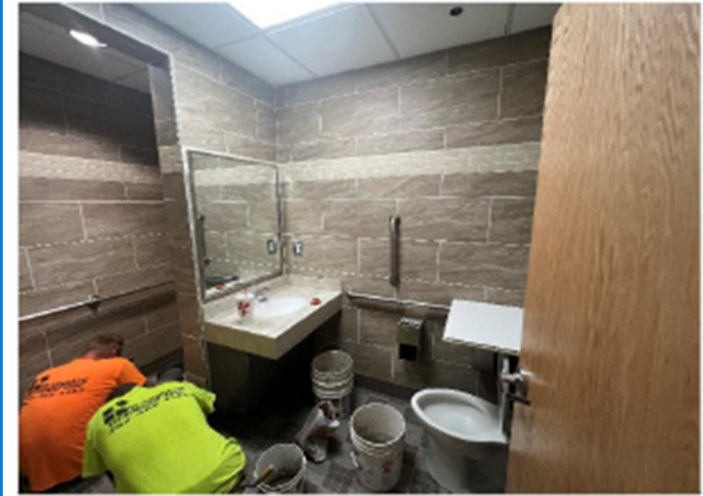
VIP Lounge restroom fixtures & accessories installed at VIP Lounge