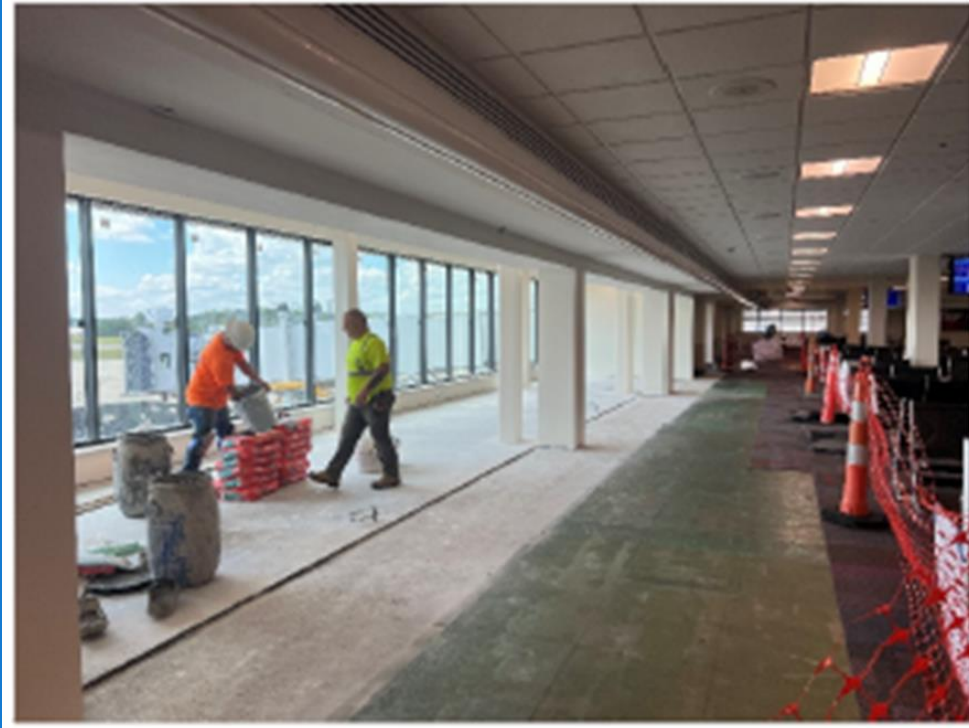
Concourse B expansion