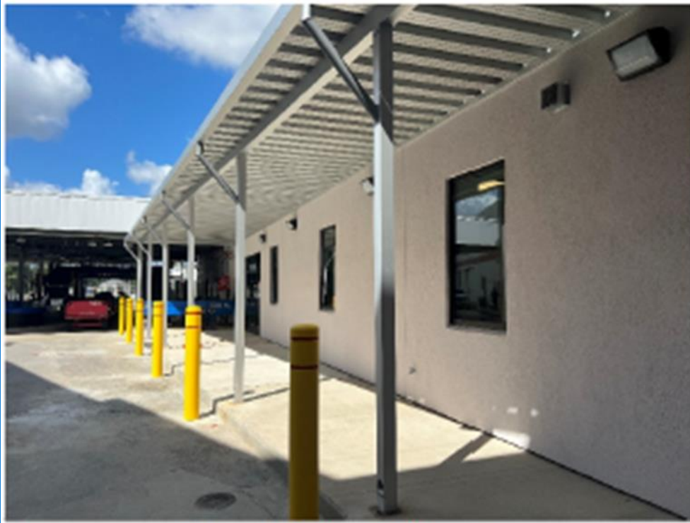
Canopy complete at Airline Office