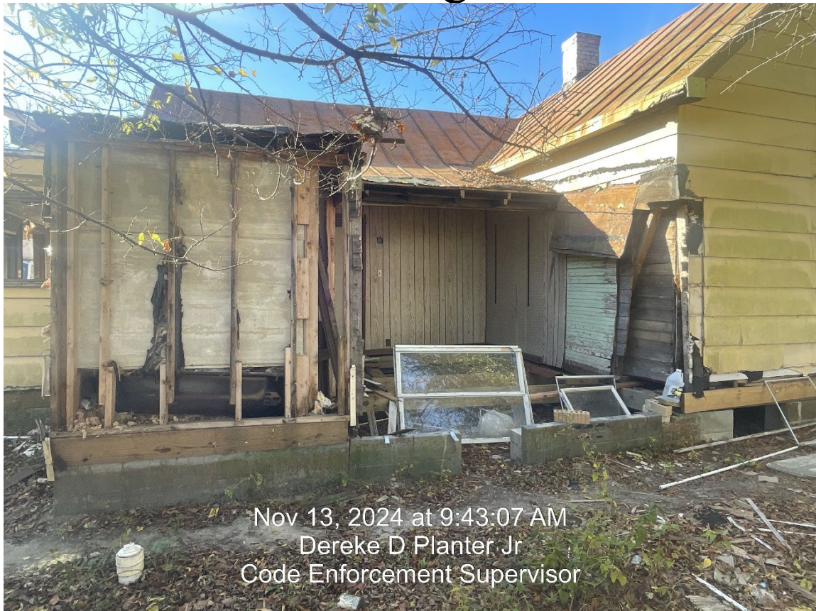
Nov 13, 2024 at 9:43:07 AM Dereke D Planter Jr Code Enforcement Supervisor