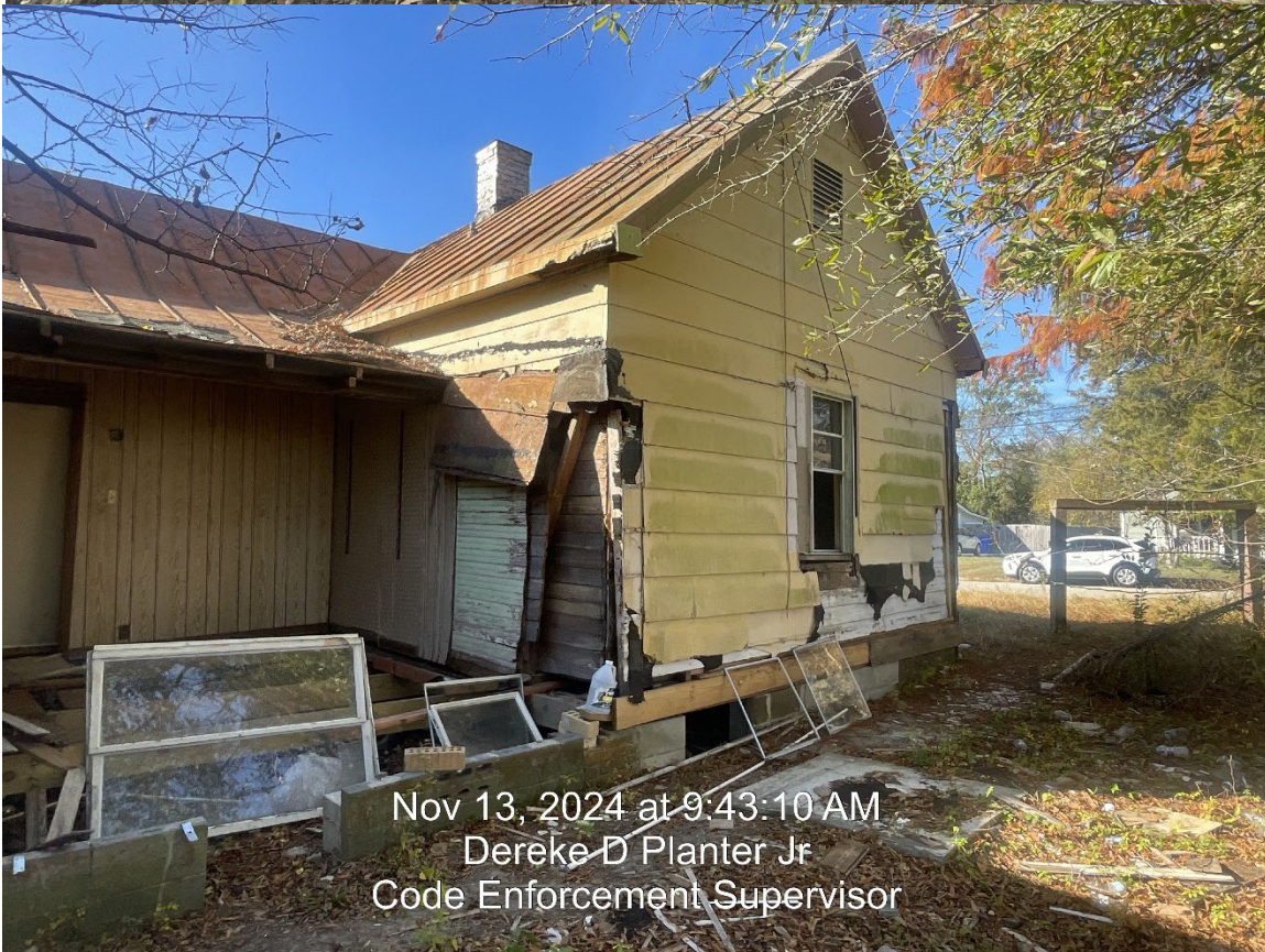
Nov 13, 2024 at 9:43:10 AM Dereke D Planter Jr Code Enforcement Supervisor

(All exterior finish shall be weathertight without excessive holes, cracks or rotted boards which permit air or water to penetrate rooms; roof covering shall not be loose, nor have holes or leaks; Windows shall be reasonably weathertight with no broken glass)