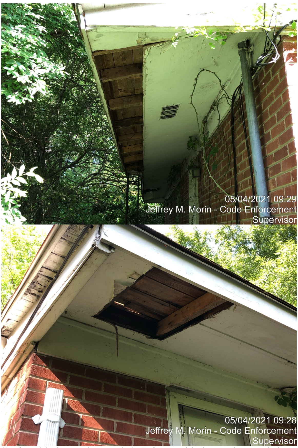
(Roof rotted, broken, sagging excessively; Rafters rotted, broken, sagging excessively or having improperly supported ends)