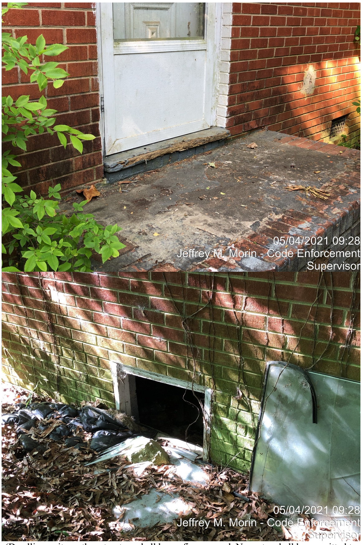
(Dwelling unit or other structure shall be on firm ground. No water shall be permitted to stand under such dwelling or structure.)